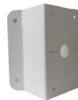
DS-1276ZJ Corner Mount