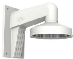
DS-1273ZJ-DM32 Wall Mount